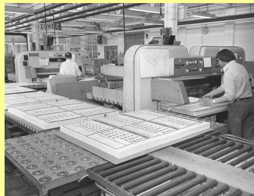
The Battery of Guillotines