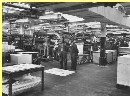
The Litho Department

The Engineering department was made up of engineers, electricians, joiners and decorators. It included a garage which looked after the company's fleet of vehicles.